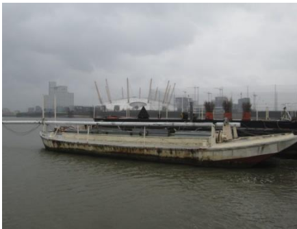
"Boat to Pablo"